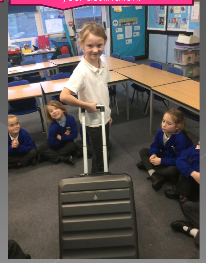
These are things you would need for somewhere warm.

Suitcases have wheels and handles so that they are easy to take to your destination.